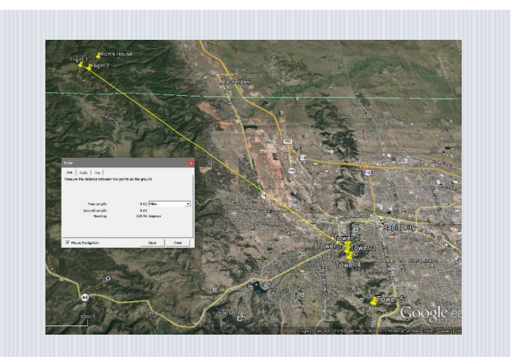
Figure 1 - 9 Mile Point to Point

One of the first issues the steering committee ran into was determining tower and relay locations within the hilly community and to neighboring Rapid City.